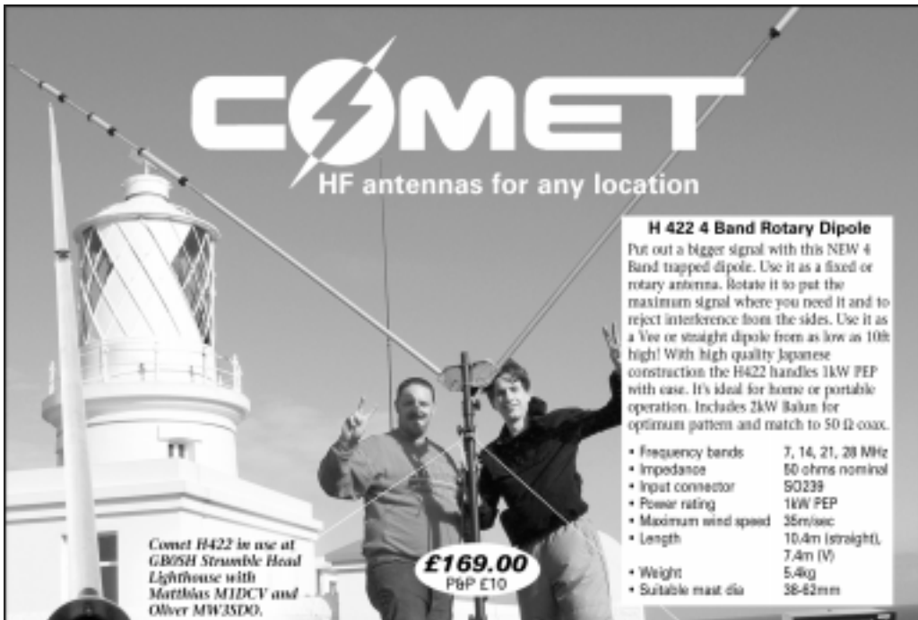
Comet H422 in use at GB05H Strawble Head Lighthouse with Morthlas M1DCV and Oliver MW3500.