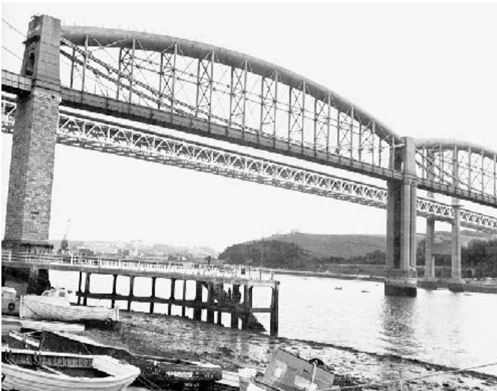
Royal Albert Bridge, Saltash

The late eighteenth and nineteenth century was an age that bred giants in the field of engineering. Isambard Kingdom Brunel was the last and, surely, greatest of them all. April 9th 2006 is the 200th anniversary of his birth.